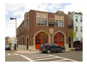
2008 Zumix, Boston

Facing Page: YouthBuild volunteers assist with redevelopment of home at 23 Hollis Street in Worcester (page 34).