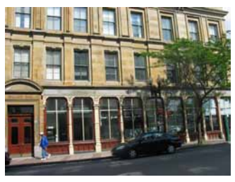
1999 Palladio Hall, Boston