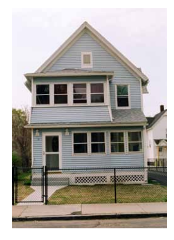
NSLF project 19 Ashley Street in Springfield, Massachusetts.