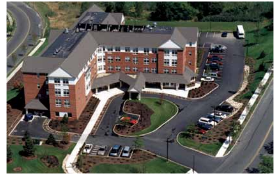
1995 Cohen Florence Levine Estates, Chelsea

The later part of the 1990s was marked by huge shifts in the environment for financing affordable housing. Having navigated economic hard times, MHIC now faced a new set of challenges – an improving economy, consolidation of the banking industry, an unevenly rebounding real estate market, and an overhaul of federal housing policy. This was a transformative period. For MHIC this was a time to test its ability to change as conditions dictated – but also to innovate.