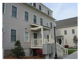
2001 State Street Apartments, New Bedford

A pivotal growth event occurred in 2003 when MHIC received its first allocation of $25 million of New Markets Tax Credits (NMTC) from the U.S. Treasury Department. A first New Markets Fund closed in 2004. A second NMTC award of $90 million was received in 2004. MHIC developed the expertise and resources to provide gap financing for high impact commercial, nonprofit and mixed-use properties. By the end of 2004, MHIC financed five of its first commercial properties using New Markets financing. Additional NMTC awards of $54 million were received in 2005 and $90 million in 2006 for a total of $259 million. MHIC had established itself as one of the major NMTC participants in the country.