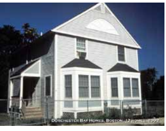
1992 Dorchester Buildable Lots. Dorchester

In 1994 MHIC established the Massachusetts Housing Equity Fund, Inc. (MHEF), a wholly—owned subsidiary, and launched its first equity fund. Prior to establishing the fund, MHIC coordinated the direct placement of low-income housing tax credits with individual banks. MHEF streamlined the process and enabled MHIC to broaden its base of investors. Also during this period the OneStop application process was developed to simplify the lending process and MHIC introduced the OneSource Program, a joint project with the Massachusetts Housing Partnership Fund. By the end of its fifth year in 1995, MHIC had a staff of 17.