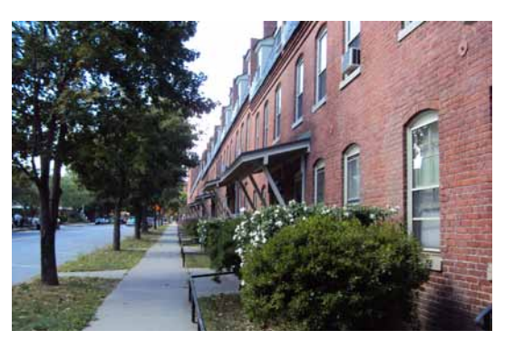
2000 Crocker Cutlery, Turners Falls

One of the major challenges MHIC faced was the loss of affordable housing units and threat to neighborhood stabilization due to the surging real estate market and the escalation of acquisition costs. To address that problem, MHIC focused on getting as many properties as possible into the hands of property owners who intended to keep them affordable.