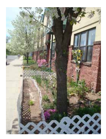
1997 Voces de Esperanza, Holyoke