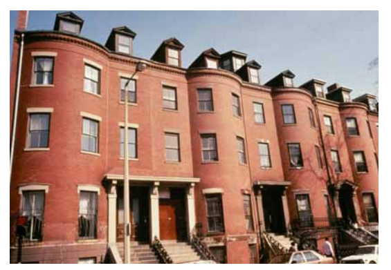
1991 604 Massachusetts Avenue, Boston

tion started out with $100 million in commitments from banks for loan and tax credit equity